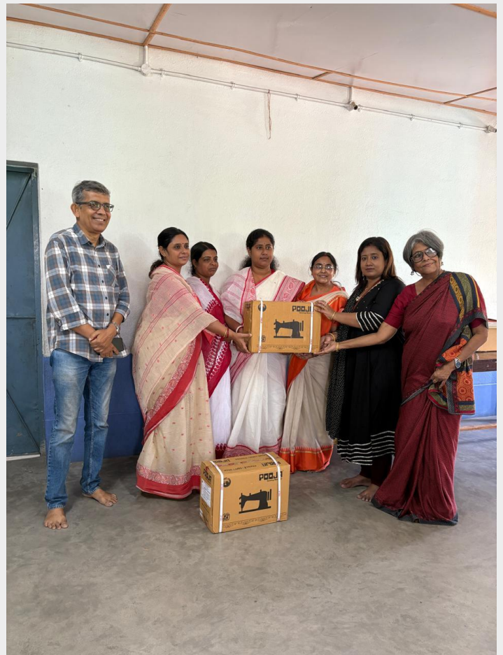
Distribution of Sewing machine at Nivedita Shishu Vihar, Naihati